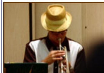
2004 Luncheon entertainment

Make your reservations TODAY to make sure that you are in on all of the fun!